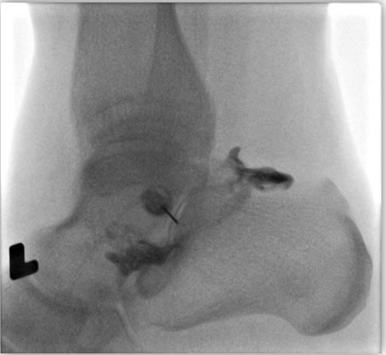
Fig 8. Lateral fluoroscopic view of the left ankle demonstrating contrast within the subtalar joint and distributing within both the anterior and posterior recesses.