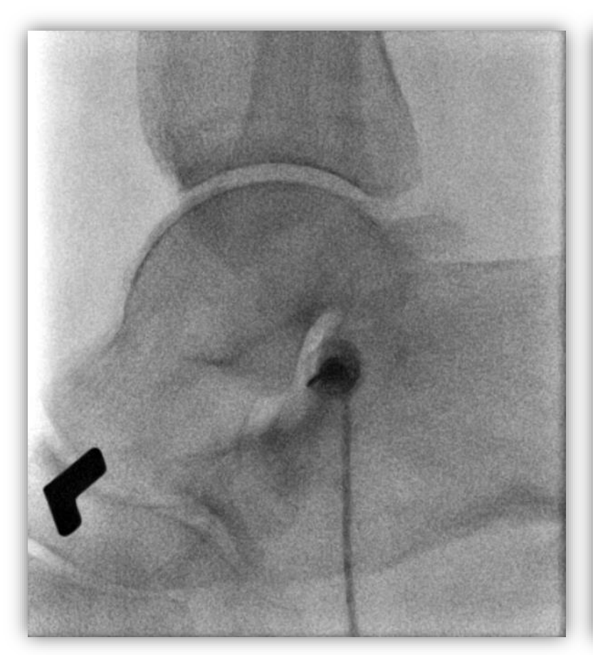
Fig 3. Lateral fluoroscopic view of the left ankle demonstrating proper needle tip positioning within the posterior subtalar joint.