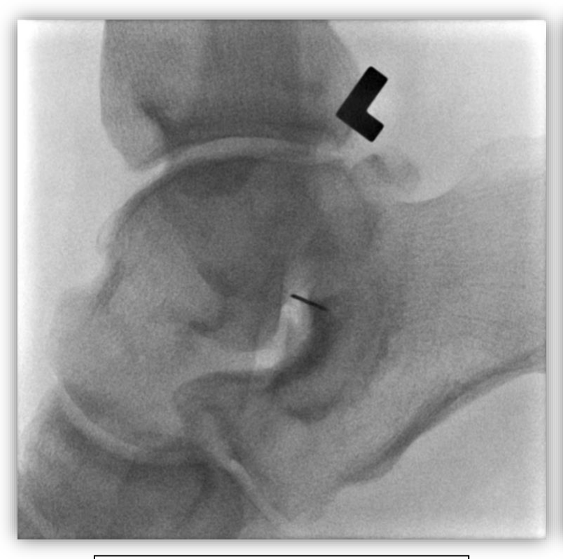
Fig 5. Lateral fluoroscopic view of the left ankle demonstrating proper needle tip positioning within the posterior subtalar joint.