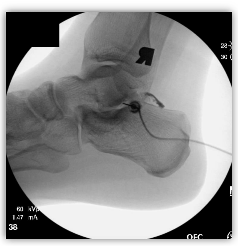
Fig 2. Lateral fluoroscopic view of the right ankle demonstrating contrast within the subtalar joint and distributing within the posterior recess.