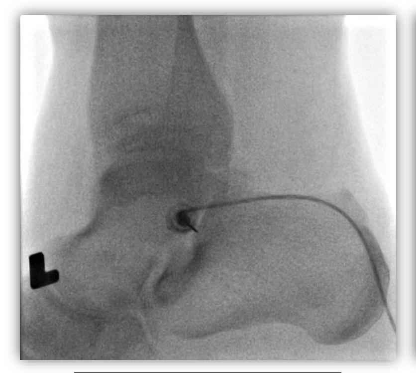
Fig 7. Lateral fluoroscopic view of the left ankle demonstrating proper needle tip positioning within the posterior subtalar joint.