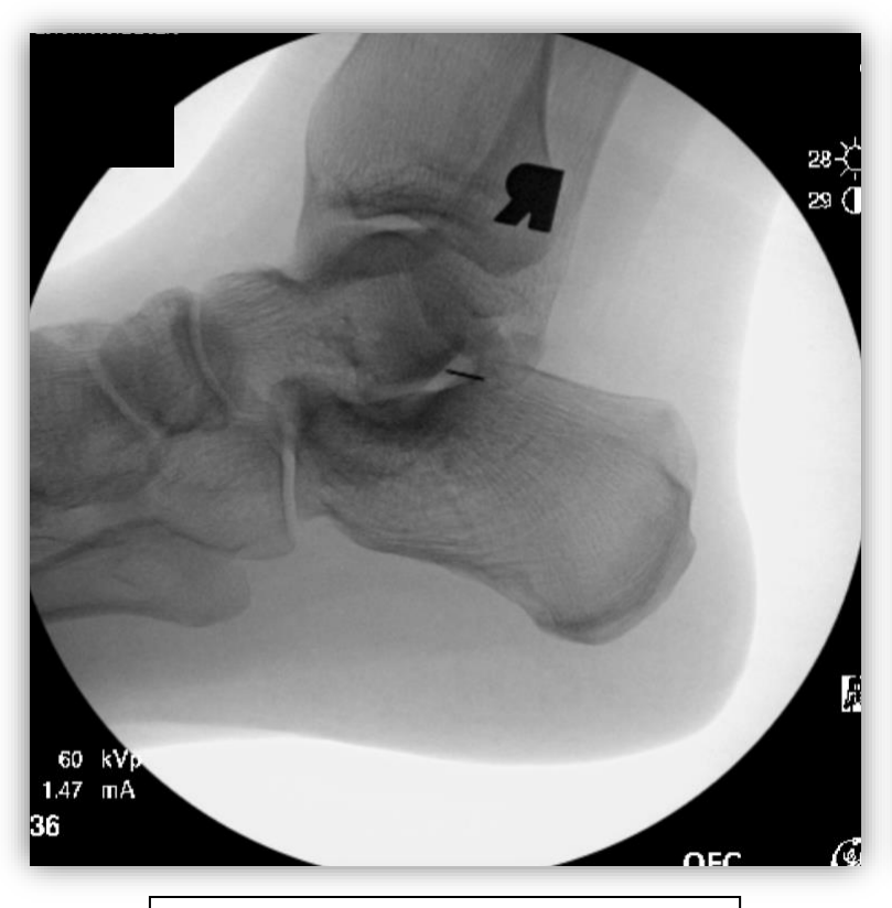
Fig 1. Lateral fluoroscopic view of the right ankle demonstrating proper needle tip positioning within the posterior subtalar joint.