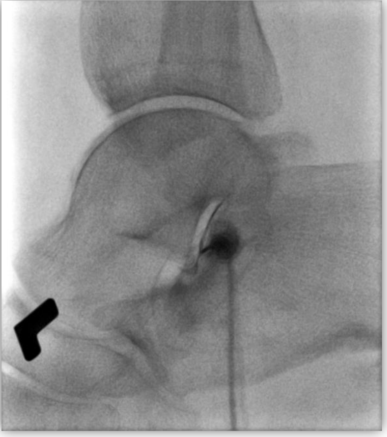
Fig 4. Lateral fluoroscopic view of the left ankle demonstrating contrast within the subtalar joint.