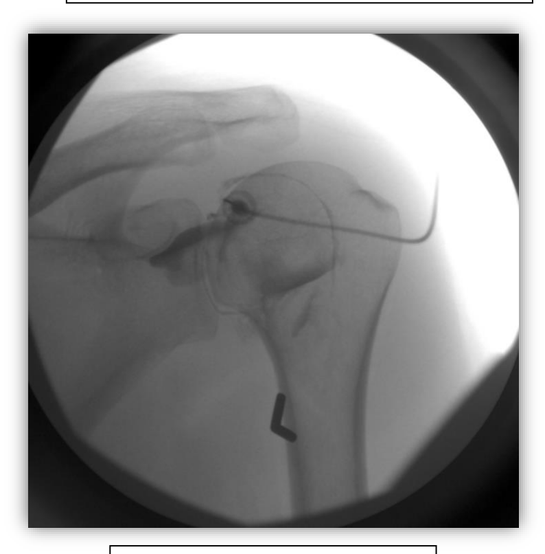
Fig 8. Frontal fluoroscopic image of the left shoulder demonstrating flow of iodinated contrast within the joint space.