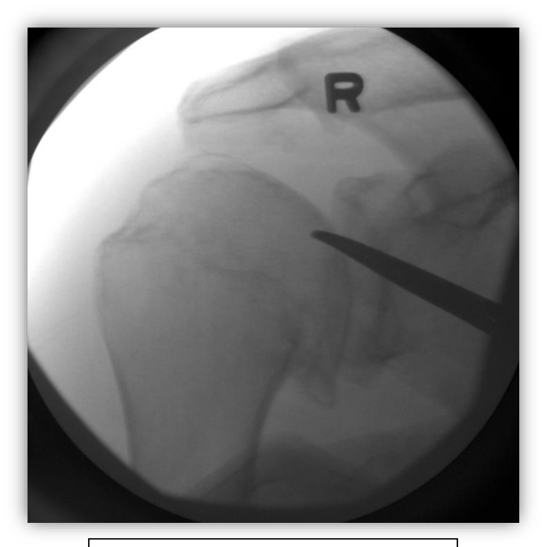
Fig 5. Frontal fluoroscopic image of the right shoulder demonstrating forceps placement for skin marking within the rotator interval.