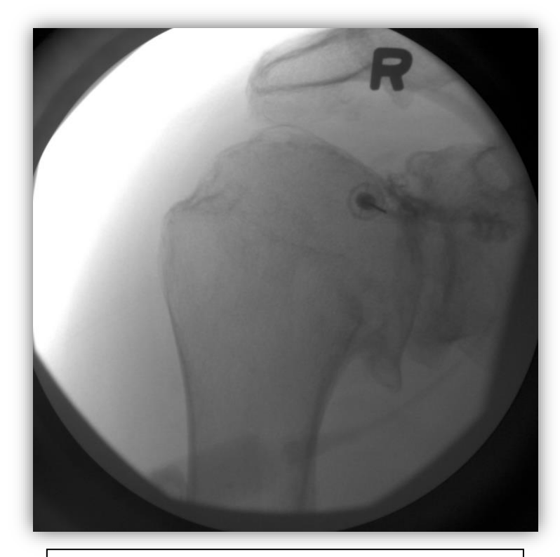
Fig 6. Frontal fluoroscopic image of the right shoulder demonstrating proper needle positioning with intraarticular contrast extending within the subscapularis recess.