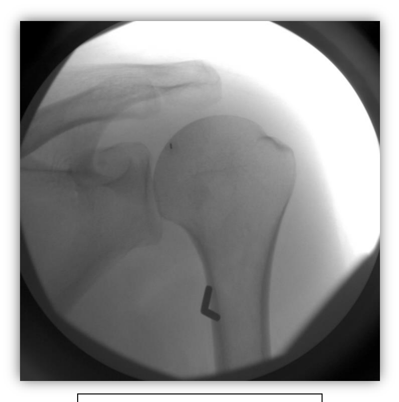
Fig 7. Frontal fluoroscopic image of the left shoulder demonstrating proper needle tip positioning within the rotator interval.