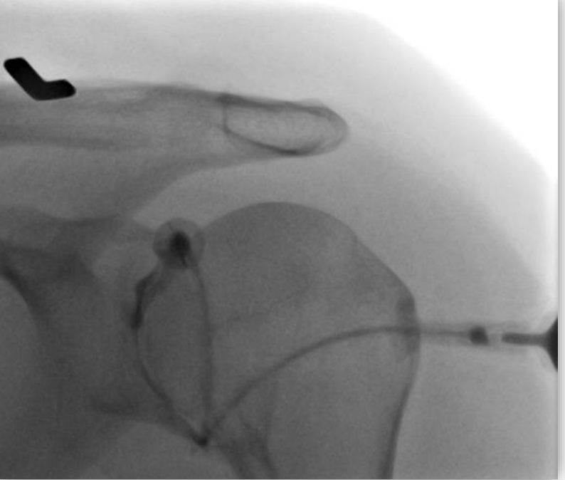
Fig 4. Frontal fluoroscopic image of the left shoulder demonstrating dilution of contrast within the joint space, as evidenced inferior and posterior to the bony glenoid.