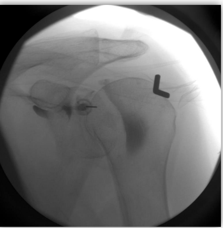
Fig 2. Frontal fluoroscopic image of the left shoulder demonstrating dilution of contrast within the joint space, extending within the subscapularis recess.