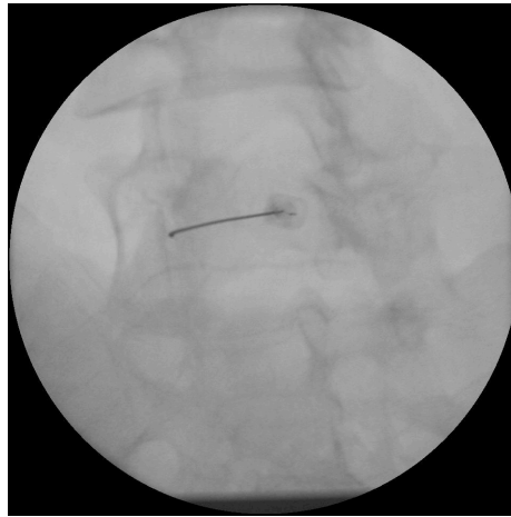
Fig 1: Facet needle positioning, oblique