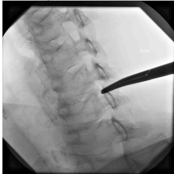
Fig 1: Foramen selection, compound oblique angle.